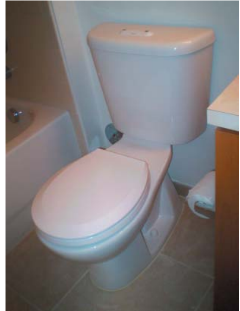
Caroma toilet installation in Tallman Pines.

In 2009, Caroma is replacing the Sydney range of high efficiency toilets with Sydney Smart HETs, providing even greater water savings. The dual flush Sydney Smart range uses 1.28 gallons per flush for a full flush and 0.8 gallons per flush for half flush, averaging only 0.9 gallons per flush. The Sydney Smart range includes six bowl configurations and is now available in white and biscuit.